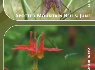
RED COLUMBINE: MAY-JULY